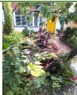
a fabulous front garden Could it be yours?