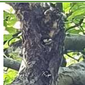
Greater Spotted Woodpecker seen peeping out of a cavity in a precious old apple tree.