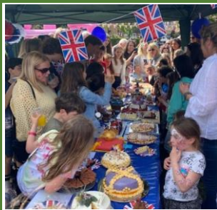
...did someone say 'cake'?