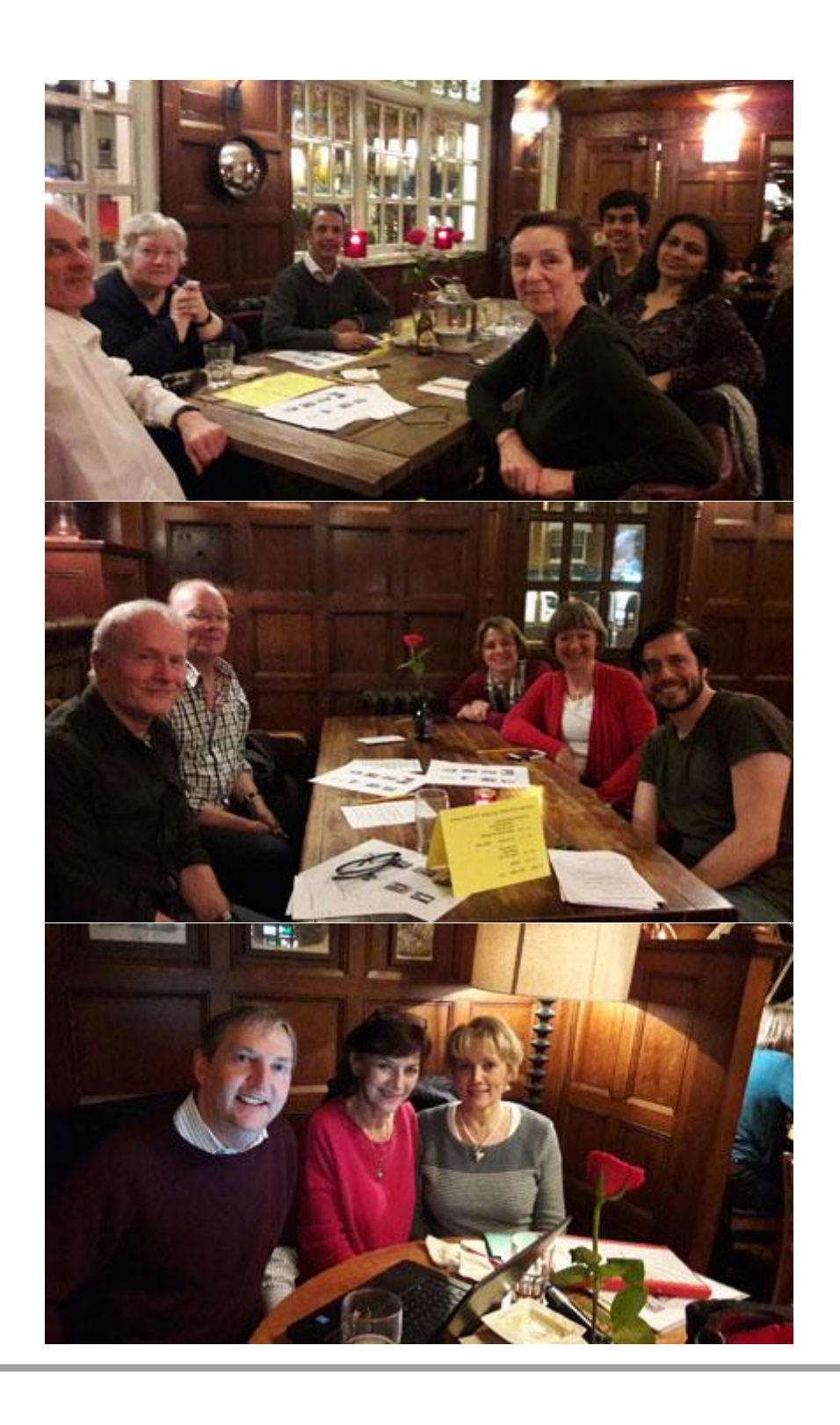
Mezze in March Tues 28th March 2017