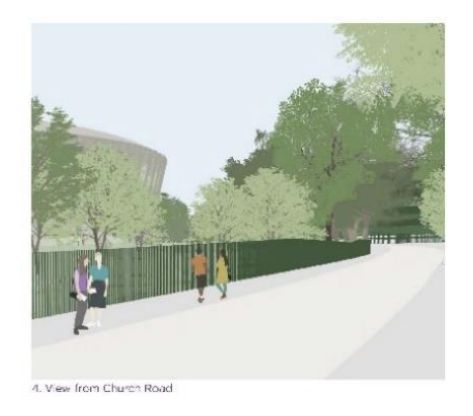
photo 2: a similar view of the Wimbledon Pk Golf Club site if the proposed 8000-seater tennis stadium was Approved