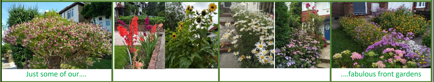
Just some of our....